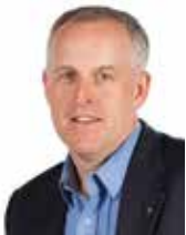
DIARMUID O'CONNELL TESLA