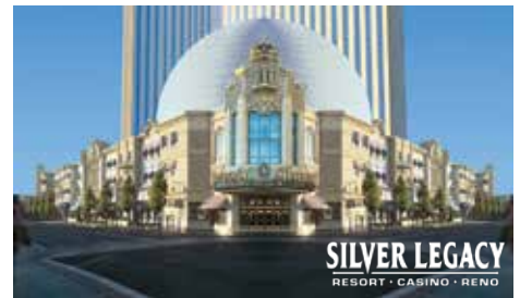
SILVER LEGACY - HOST HOTEL SPECIAL RATE FOR ATTENDEES - $59.99

Silver Legacy Resort Casino is a historically themed masterpiece, with turn-of-the-century elegance. Silver Legacy's lodging in Reno is perfectly situated in the heart of downtown connected to the Eldorado Hotel Casino and Circus Circus Reno by skyways and within walking distance of a number of entertainment venues, including the University of Nevada. To and From Tahoe Reno Airport transportation is available. Special rates are available until August 21, 2016. PLEASE NOTE: Rates are subject to a $15 per room, per night resort fee as well as a $3 City of Reno Facility Fee. Call 1-800-687-8733 and use code WNDD6KK when making room reservation. Special rates are available until August 21, 2016.