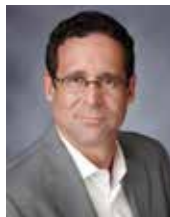
ROBERT LANG BROOKINGS INSTITUTE