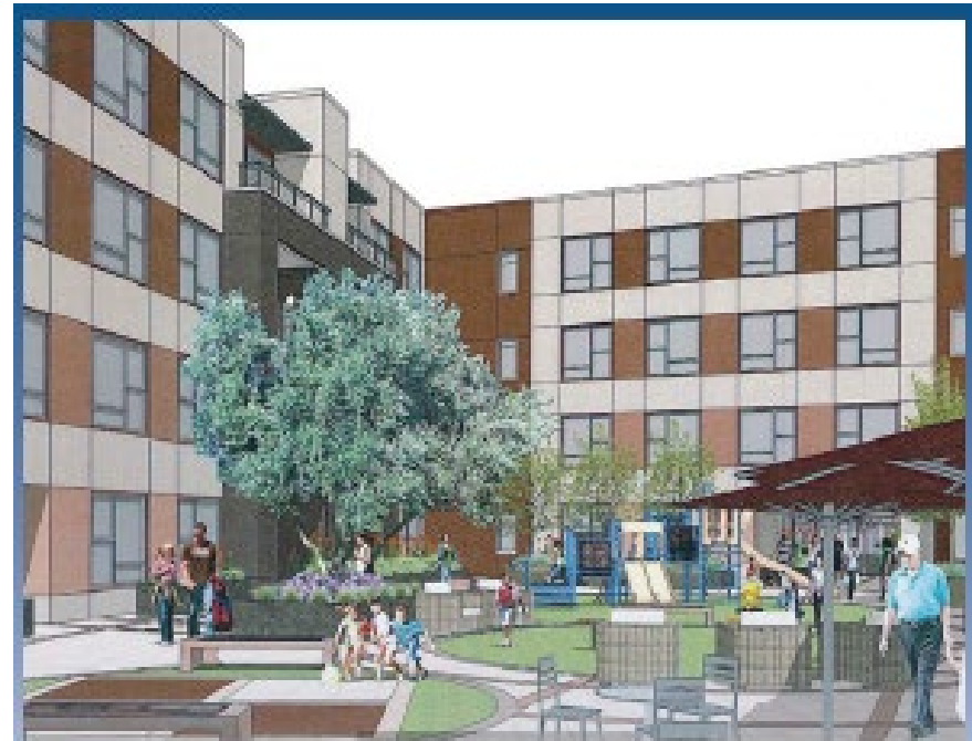
AFTER: Mixed-use Affordable Housing and Commercial Development