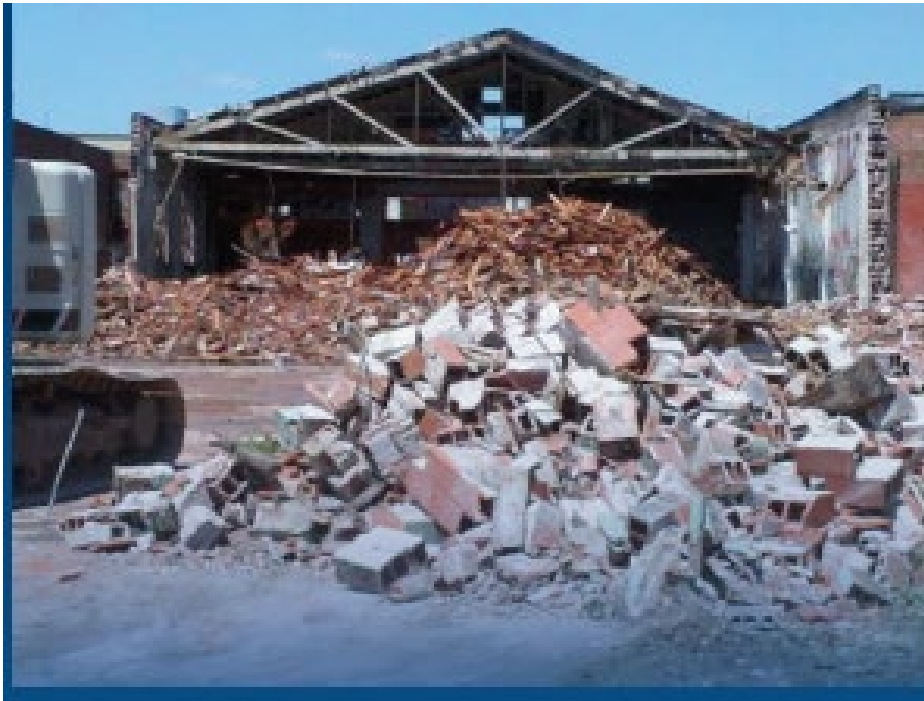
BEFORE: Auto Repair and Machine Shop